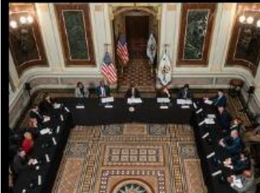
National Space Council Users' Advisory Group: Meetings