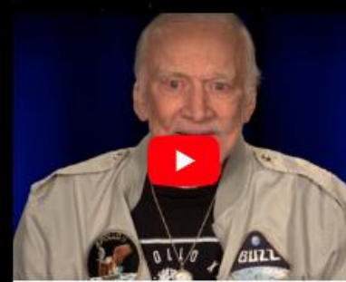
Buzz Aldrin Addresses the UAG