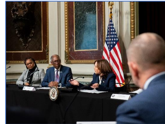
Meeting with VP