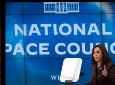
Designated Federal Officer Roster and Biographies