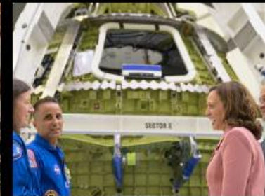
National Space Council Users' Advisory Group: Findings and...