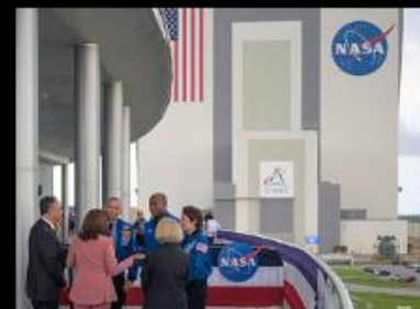
National Space Council Users' Advisory Group: Federal Register...