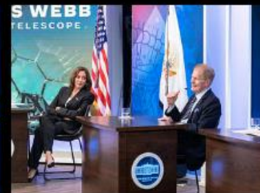
National Space Council Users' Advisory Group: NASA News Releases