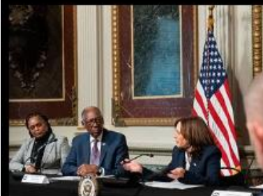
UAG Membership Roster and Biographies