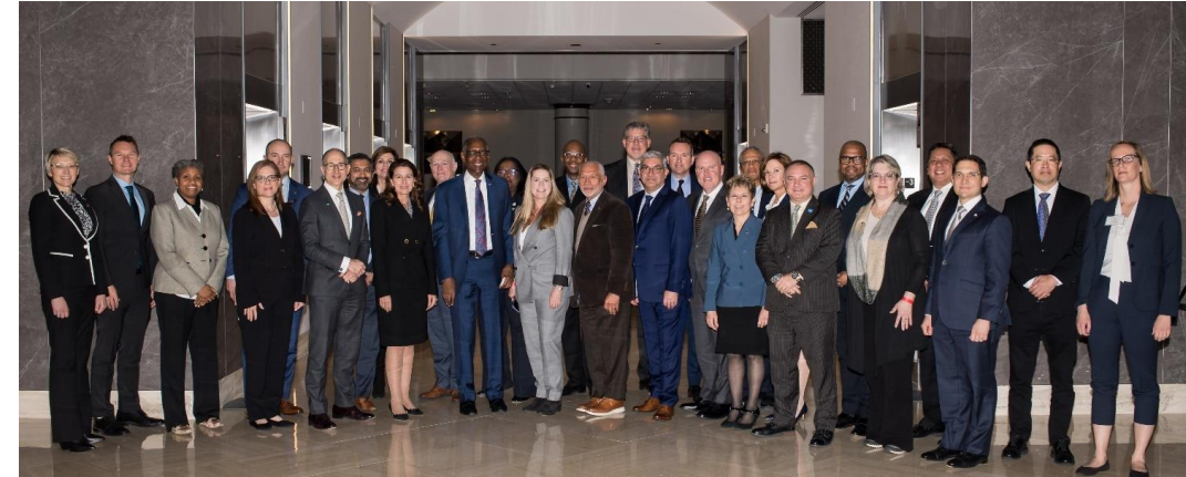
Feb. 23, 2023, UAG Meeting