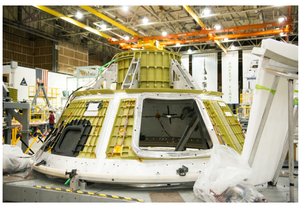
Seven Oregon suppliers contributed to NASA's Artemis program. An example of the state's contributions is the supply of different electronic components like fiber channel connectors and switches for Orion.