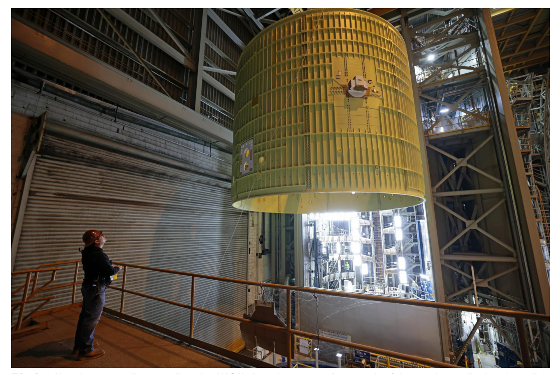
Fifty-four New Jersey suppliers contributed to NASA's Artemis program. An example of the state's contributions is textile materials used on Artemis for thermal protection.