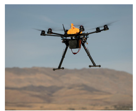
Test of NASA's Unmanned Aircraft Systems Traffic Management (UTM) technical capability Level 2 (TCL2) at Reno-Stead Airport, Nevada.

Eleven Nevada suppliers contributed to NASA's Artemis program. An example of the state's contributions is composite materials used for panels on Orion for Artemis I.