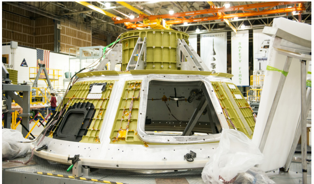
Four Nebraska suppliers contributed to NASA's Artemis program. An example of the state's contributions is the supply of different electronic components like fiber channel connectors and switches for Orion.

For more information about the Economic Impact Report for your state, go to: