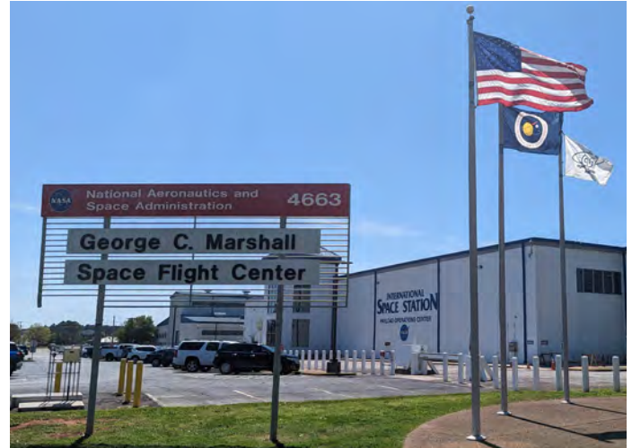
Huntsville Operations Support Center at NASA's Marshall Space Flight Center

State-of-the-art Command and Control, Telemetry, Voice, Video services