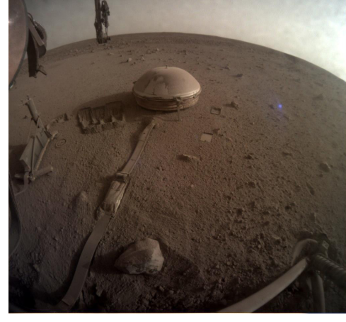
NASA's InSight Mars lander captured this image and shows InSight's seismometer on the Red Planet's surface.