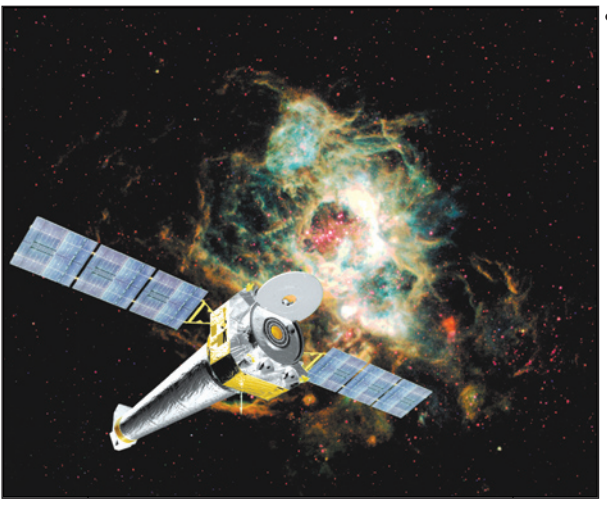
Artist concept of the Chandra X-ray Observatory.