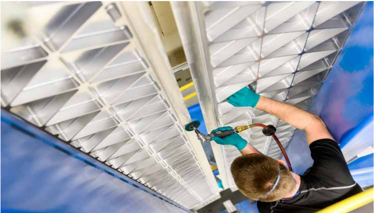
Weld confidence panels for the EUS interstage produced at NASA's Michoud Assembly Facility.

National Aeronautics and Space Administration