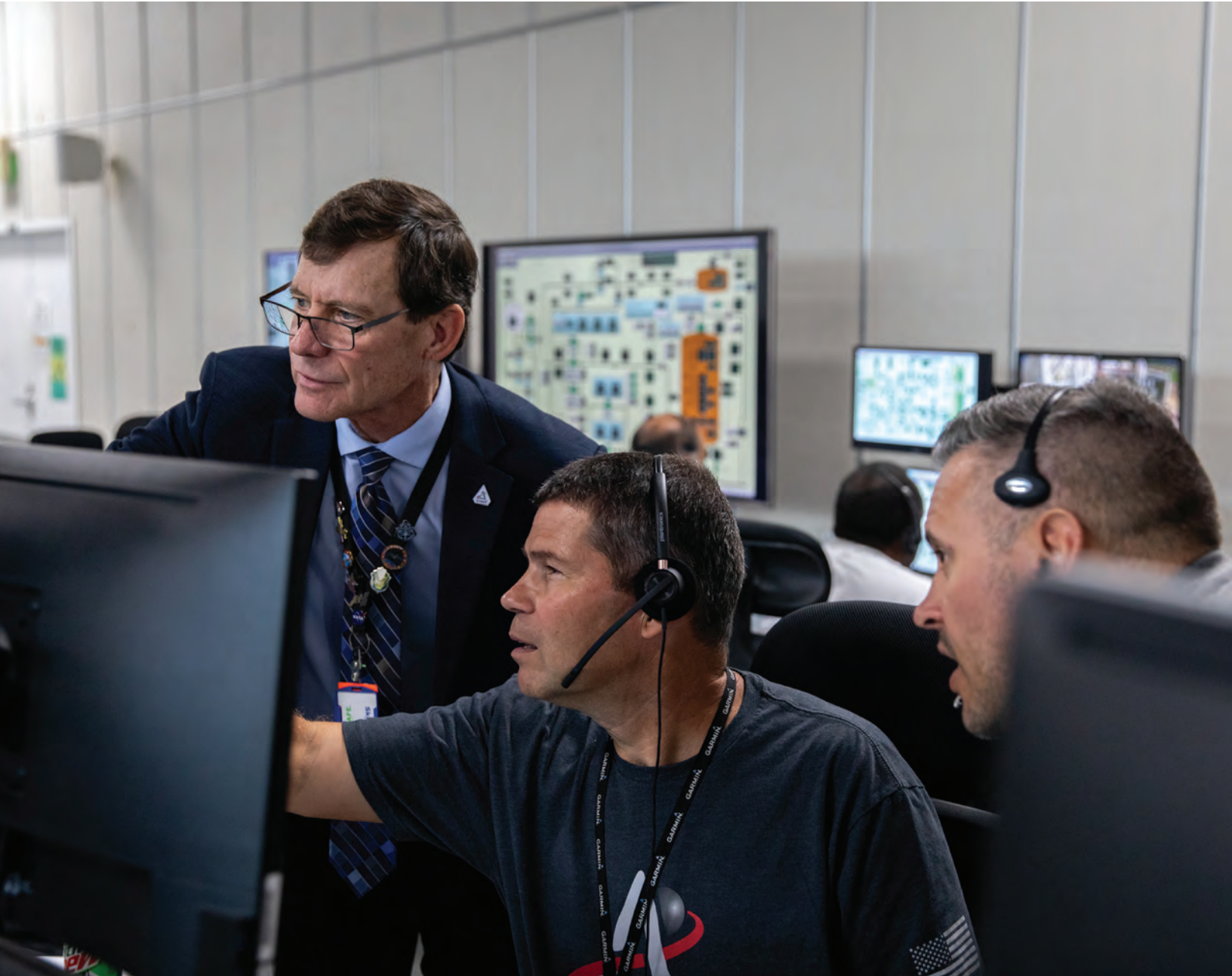
SLS Chief Engineer Dr. John Blevins, center, works with members of the launch team in Firing Room 2 at Kennedy's Launch Control Center during the cryogenic propellant loading demonstration test on Sept. 21, 2022.

NASA and the human spaceflight community are on the brink of a new era of deep space exploration. The Artemis I mission will be the first flight of NASA's new Space Launch System (SLS) rocket and Orion spacecraft. Artemis I was rolled out to the launch pad on Aug. 16-17 for its maiden voyage. During that Aug. 29 launch attempt, due to a sensor issue, teams were not able to confirm a proper chilldown of the four RS-25 engines, with engine 3 showing higher temperatures than the other engines. Teams also saw a hydrogen leak during tanking. A second launch attempt was performed on Sept. 3, but was called off due to another, separate hydrogen leak during tanking operations.