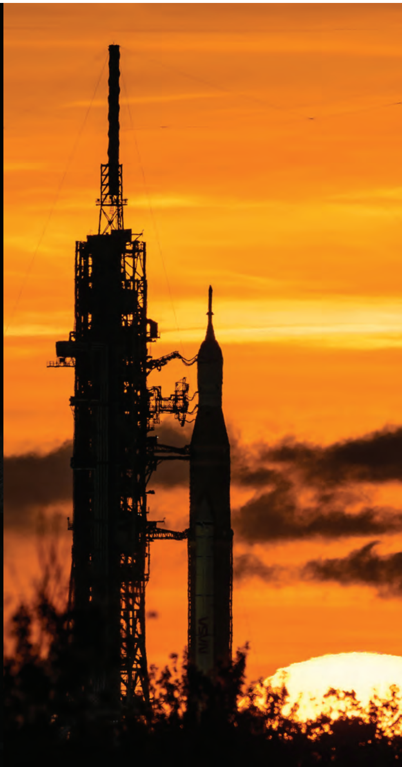
The Artemis I Space Launch System (SLS) rocket and Orion spacecraft stand at Launch Pad 39B during sunrise on Aug. 31, 2022.