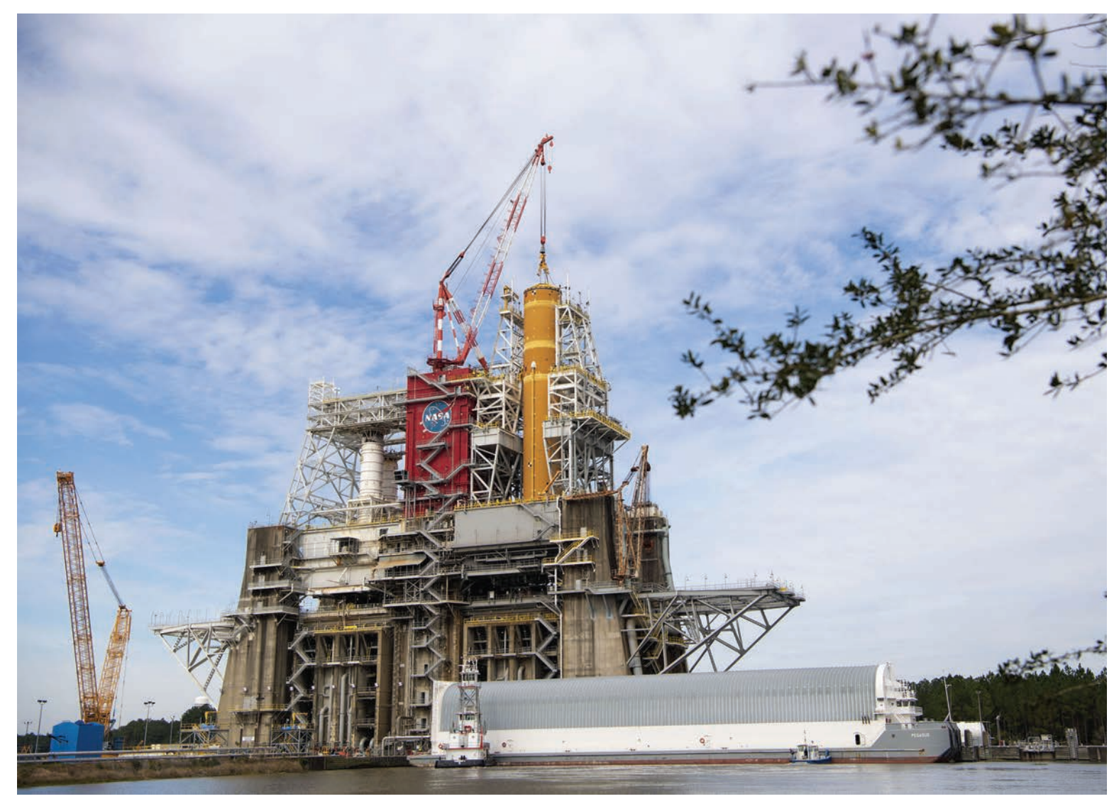
The core stage that will fly on the Artemis I mission is installed in the B-2 Test Stand at Stennis Space Center near Bay St. Louis, Mississippi, for Green Run testing. The test series is scheduled to take place over several months.

Crews used large cranes to lift the Artemis I core stage for installation in the B-2 test stand. The stage includes the liquid hydrogen and liquid oxygen tanks, four RS-25 engines and the vehicle's avionics and flight computers. When it is filled with all 733,000 gallons of propellant for flight, the stage will weigh more than 2 million pounds and will have the power to reach Mach 23 – faster than 17,000 miles per hour.