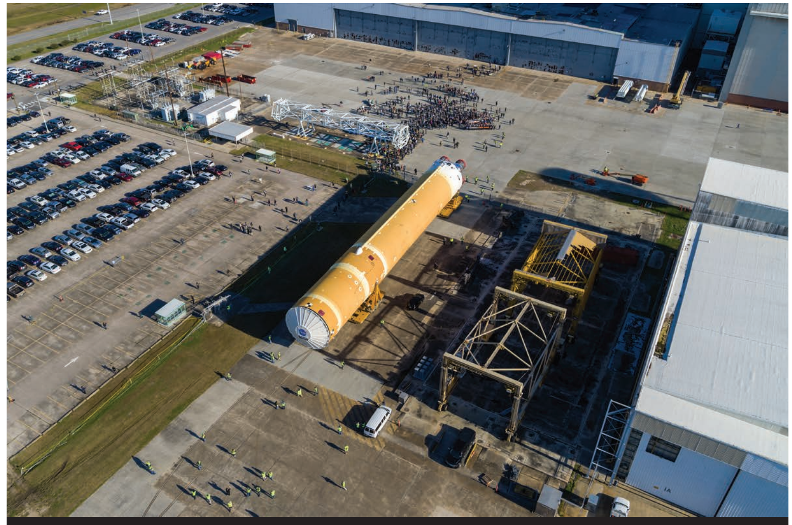
Employees at Michoud Assembly Facility in New Orleans gather to watch as the Artemis I core stage is readied to ship to Stennis Space Center near Bay St. Louis, Mississippi, for the Green Run test series.

NASA teams at Michoud Assembly Facility and Stennis Space Center worked together to transport and prepare for testing the largest core stage the agency has ever built.