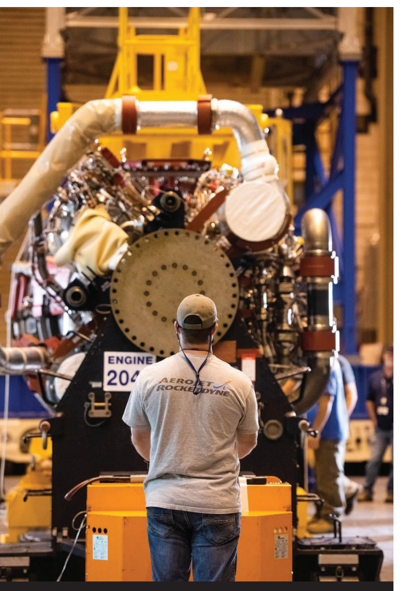
Aerojet Rocketdyne is under contract to build 18 additional RS-25 engines to support Artemis missions.

In April the agency awarded a contract to Aerojet Rocketdyne of Sacramento, California, to manufacture 18 additional SLS RS-25 rocket engines to support Artemis missions to the Moon. The agreement modifies the initial contract to recertify and produce six of the engines, for a total contract value of $3.5 billion, with a period of performance through Sept. 30, 2029. Working with NASA, Aerojet has implemented a plan to reduce the cost of the engines by as much as 30 percent by using advanced manufacturing techniques to modify some of the rocket components as well as simplify processes.