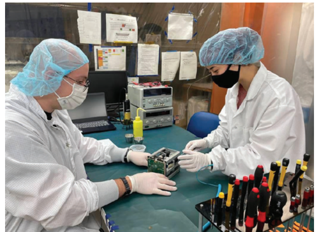
Image details: Graduate students build the test assembly of the CubeSat Laser Infrared Crosslink, or CLICK, B/C engineering development unit in a clean room at the Massachusetts Institute of Technology in Cambridge.

NASA's Small Spacecraft Technology (SST) program — a sister program to Flight Opportunities focused on rapid technology development and testing — is supporting testing in advance of two missions designed to enhance optical communications capabilities for autonomous fleets of CubeSats. Teams from Massachusetts Institute of Technology (MIT) in Cambridge and University of Florida (UF) in Gainesville are testing components of NASA's CubeSat Laser Infrared Crosslink ( CLICK ) B/C demonstration, aiming to validate that the technology can be packaged into a CubeSat and work as expected.