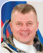
Oleg Novitsky – Flight Engineer (Roscosmos) (OH-leg NO-vit-skee)