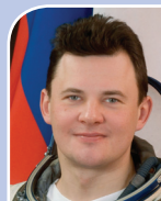
Roman Romanenko – Flight Engineer (Roscosmos) (r0-man ro-man-Yenk-o)