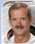
Chris Hadfield – Flight Engineer (CSA)

Soyuz TMA-07M • Launch: Dec. 19, 2012 • Landing: May 14, 2013