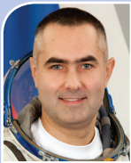
Evgeny Tarelkin – Flight Engineer (Roscosmos) (ev-GEN-nee tuh-REL-ken)