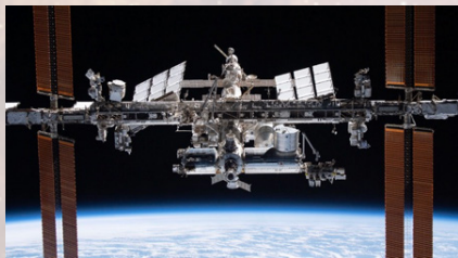
the International Space Station

Title: A REVIEW OF OPTIONS FOR A NATIONAL LAB FOR MICROGRAVITY/ORBITAL ACTIVITIES IN LEO Project Lead: Erica Rodgers Status: Complete Summary: NASA is preparing to retire the International Space Station (ISS) and transition low-Earth orbit (LEO) activities to one or more Commercial LEO Destinations