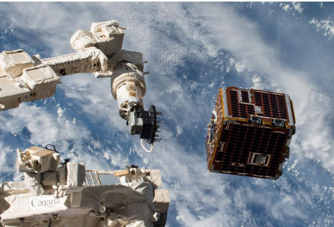
Deployment of the NanoRacks-Remove Debris Satellite from the International Space Station (ISS).

OTPS collaborates with NASA's Director of Space Architectures, who chairs the Agency Cross-Directorate Federated Board, a NASA-internal leadership group working on the Moon to Mars strategy. In its first year, OTPS supported the Executive Secretariat of the Federated Board and piloted the development of a framework to analyze spaceflight architectures.