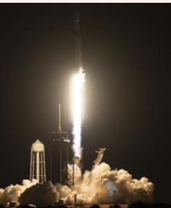
SpaceX rocket launch

Title: EXPLORING THE FUTURE OF THE SPACE SECTOR Project Lead: Kenneth Wright Status: Complete Summary: The Aerospace Safety Advisory Panel recommended that NASA develop a strategic vision for the future of space exploration and operations. In collaboration with Aerospace Corporation’s strategic foresight team, OTPS conducted eight futures roundtables with more than two hundred internal and external agency participants to develop a report on potential scenarios for 2040 and beyond. The report also investigates strategic options resilient to these scenarios and key questions NASA may consider when developing strategic plans today.