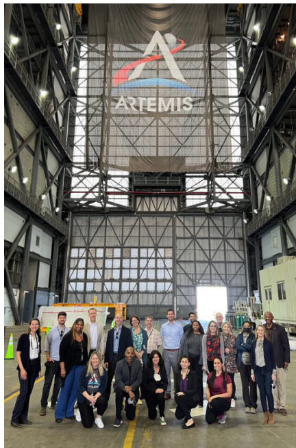
OTPS team members visit NASA's Kennedy Space Center.

In its first year, OTPS focused on several areas of importance to NASA leadership.