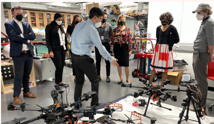
OTPS at Cal Tech.