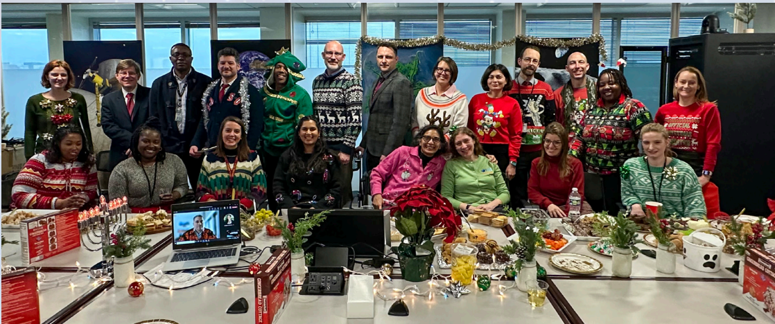
The OTPS Team celebrates the 2022 holiday season.