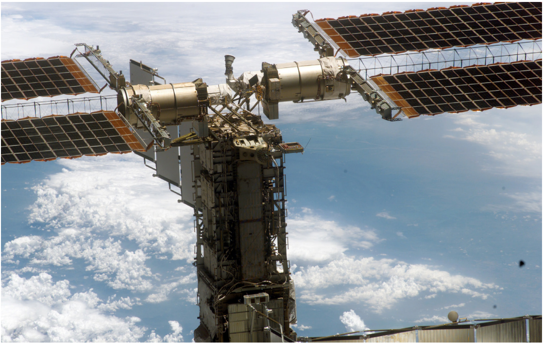
Aft view of the International Space Station.

The Aerospace Safety Advisory Panel recommended that NASA develop a strategic vision for the future of space exploration and operations. In collaboration with Aerospace Corporation’s strategic foresight team, OTPS conducted eight futures roundtables with more than 200 internal and external agency participants to develop a report on potential scenarios for 2040 and beyond. The report also investigates strategic options resilient to these scenarios and key questions NASA may consider when developing strategic plans today.