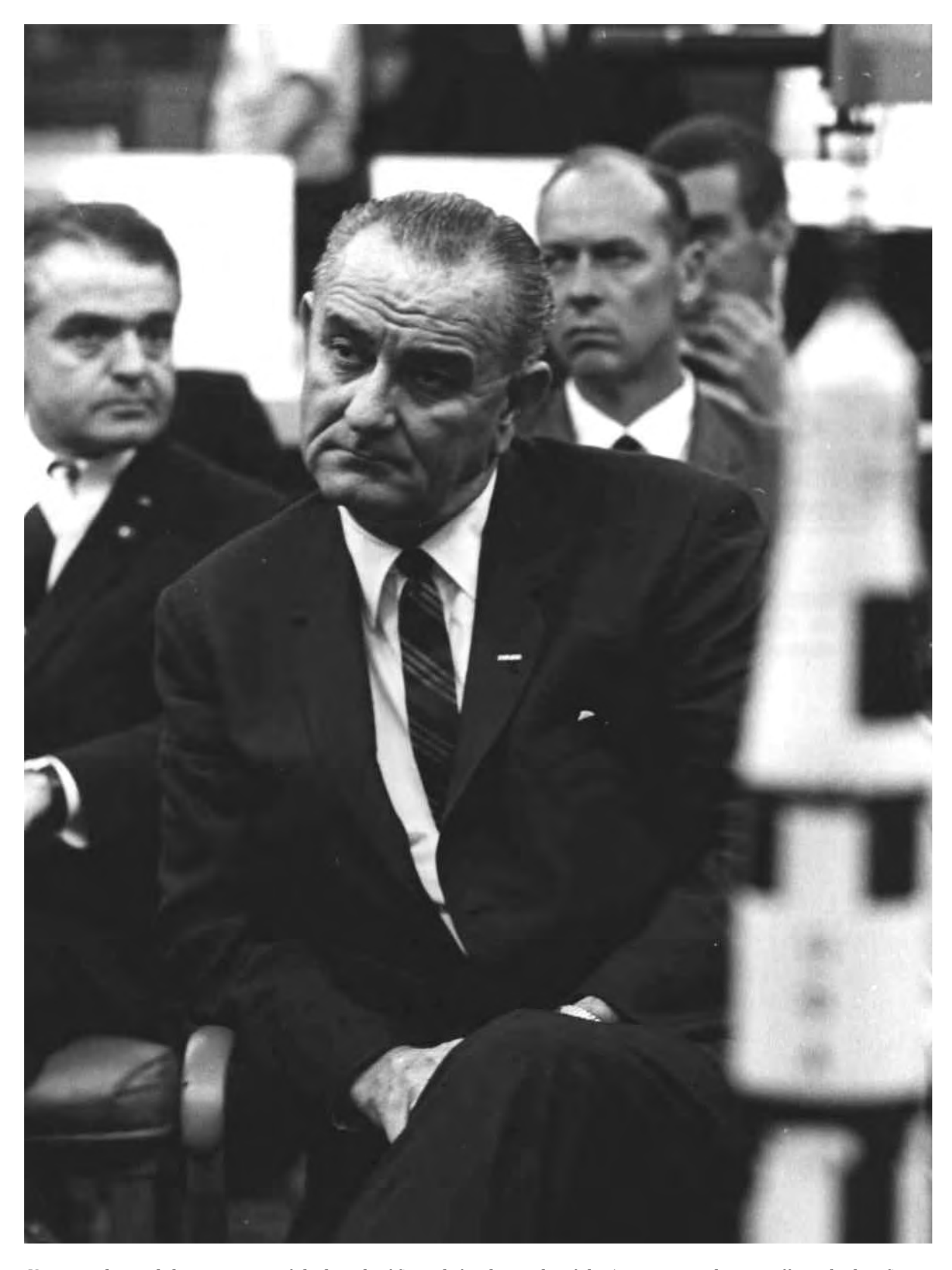
No one understood the importance of the launch of Sputnik for the psyche of the American people more effectively than Senate Majority Leader Lyndon B. Johnson. Here he is shown as president on September 15, 1964, at a meeting hosted by NASA, the agency that he helped to create with the National Aeronautics and Space Act of 1958.