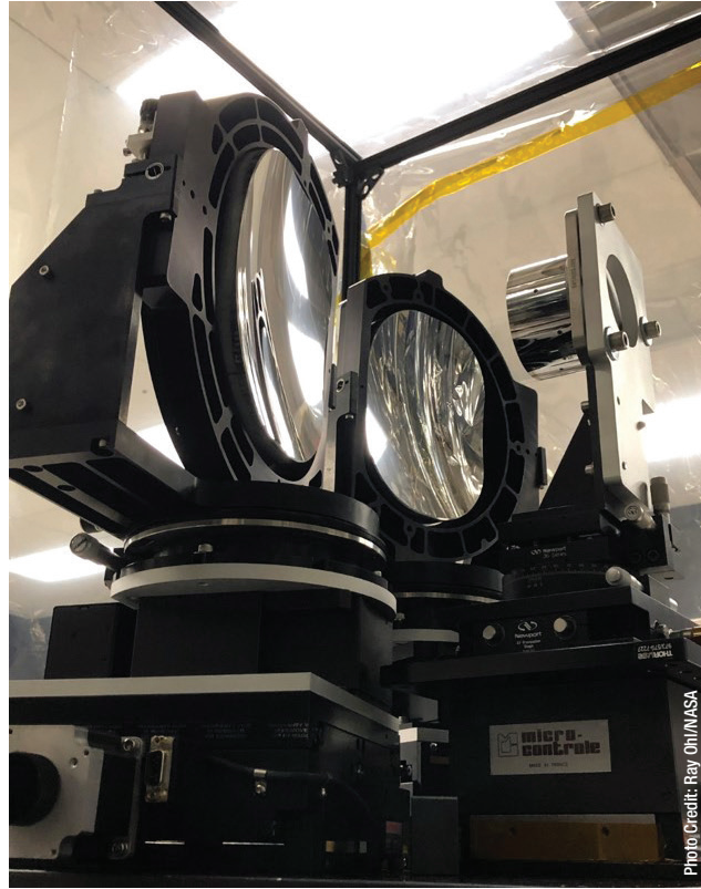
MiniSpec combines two miniaturized sensors to monitor the health of trees, among other vegetation — information needed by forest and water managers.