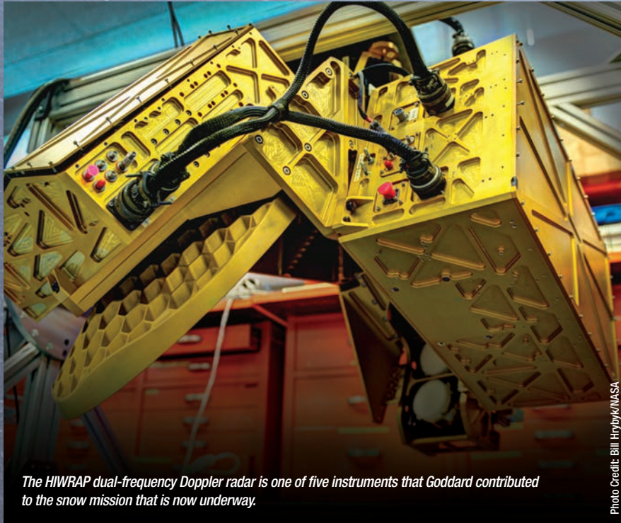
The HIWRAP dual-frequency Doppler radar is one of five instruments that Goddard contributed to the snow mission that is now underway.

Goddard originally created the Conical Scanning Millimeter-wave Imaging Radiometer to calibrate sensors for the Defense Department's Meteorological Satellite Program. This instrument pioneered the use of the submillimeter-wavelength bands to sense ice clouds ( CuttingEdge, Fall 2016, Page 13 ).