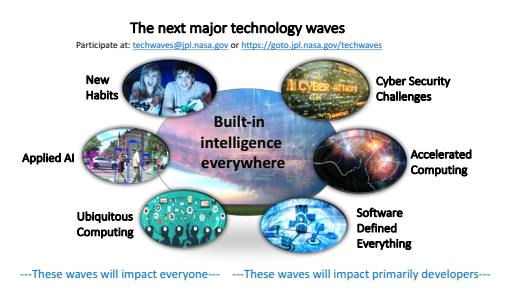
Fig 2 – The Next Technology Waves

We have uncovered six major technology waves which, when combined, form a tsunami-sized wave we call "Built-in intelligence everywhere." Information we need will be available on demand, from any device, at any location, and filtered for our needs.