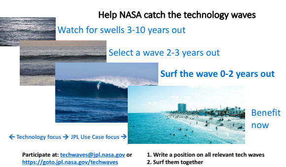
Fig 1 – We surf only the technology waves that solve actual user problems

JPL's approach: tie the new to something familiar. Living in California, we relate forecasting new technologies to searching for the perfect wave. With new technologies coming in like ocean waves at different strengths and intervals, it's up to us to decide which ones are worth surfing (i.e. prototyping and piloting). While we pay attention to technology swells ten years in the future, we will actually "surf" the ones that can solve real user problems over the next two years. This approach ensures we publish a position on everything relevant to our stakeholders while focusing our efforts on the most promising waves delivering near-term benefits. Early participation can also help influence the influencers.