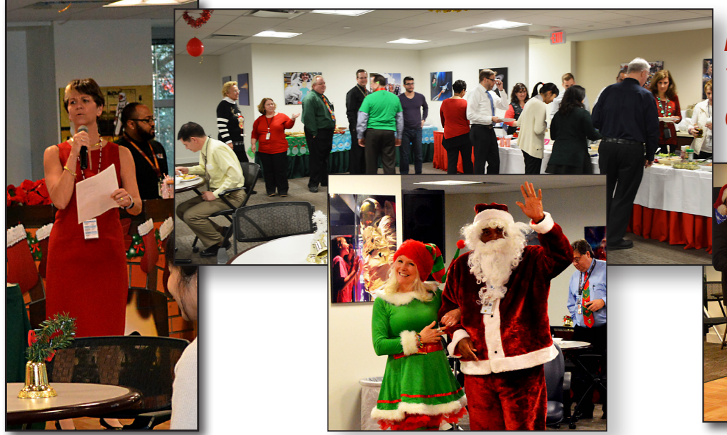
Happy New Year from the OCIO Family!