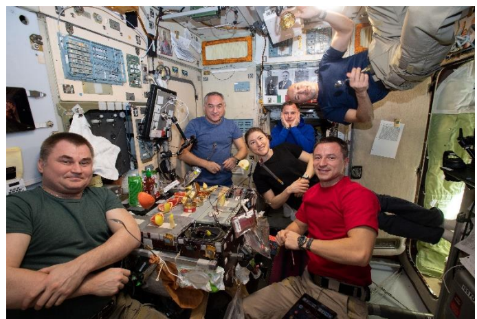
Astronauts aboard the ISS open a crew care package. Crew care packages are one means of keeping astronaut motivation and morale high, especially during long missions.

Repatriation briefings are conducted pre-flight and normally 6 weeks before landing with the astronauts and their family members. Additional behavioral support is provided on an as-needed basis to facilitate the repatriation and reintegration of the astronauts with their families and work lives.