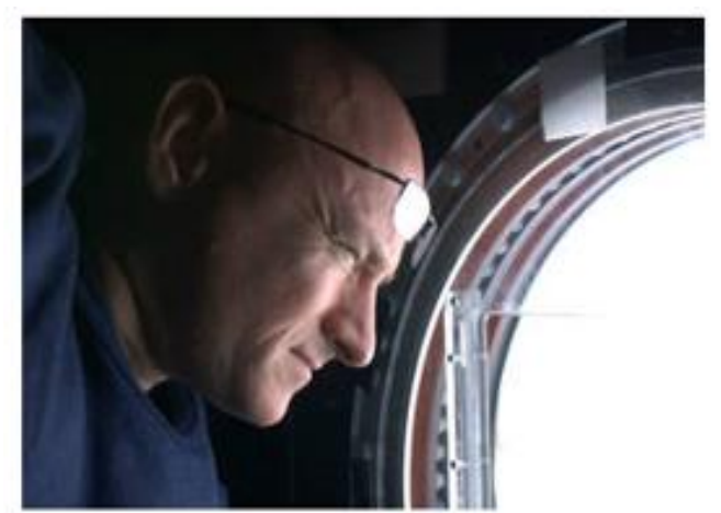
Photographing Earth and Journaling are important outlets for astronauts to manage their stress.