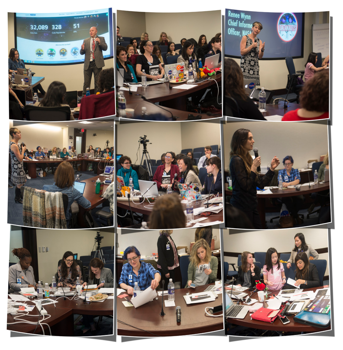
2017 Datanaut Class Kickoff Meeting, February 23 2017 – NASA Headquarters

To learn more about Datanauts, visit: <u>https://open.nasa.gov/explore/</u> <u>datanauts/</u>.