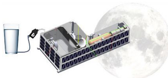
Cislunar Explorer 6 unit CubeSat splits into two; each uses water for its propellant.

Notable Technologies: Cislunar Explorers used a Cornell-designed water electrolysis propulsion system utilizing a 3D-printed titanium nozzle that burns hydrogen and oxygen safely stored as water. The 6U CubeSat splits into two 3U units that each generate sufficient power for electrolysis of the water propellant, and that spins for stability and to separate liquid water from the gases. Cornell has also developed their own CO 2 cold-gas thrusters for attitude control, and a UHF amplifier for communications at lunar distances. They use off-the-shelf cameras for optical navigation.