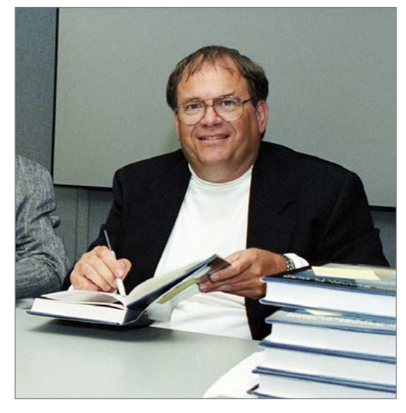
Curtis Peebles is shown above.

HE WAS THE AUTHOR OF A DOZEN BOOKS ON TOPICS THAT RANGED FROM THE VALIDITY OF UFO SIGHTINGS TO COLD WAR AEROSPACE HISTORY. HE WROTE SEVERAL BOOKS IN THE NASA HISTORY SERIES, INCLUDING COLLECTIONS OF ORAL HISTORIES FROM WHAT IS NOW ARMSTRONG FLIGHT RESEARCH CENTER.