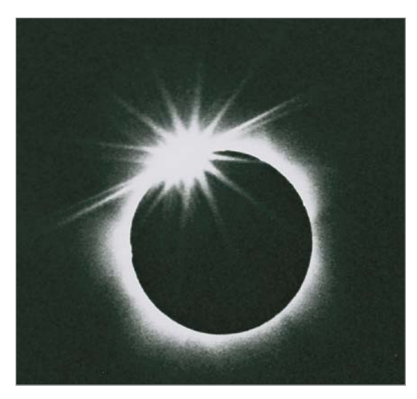
The total solar eclipse of 7 March 1970 ran along the East Coast of the United States.

Station in Virginia—now Wallops Flight Facility—to watch the eclipse. About 13,000 spectators were joined by members of Congress and NASA Deputy Associate Administrator Wernher von Braun on the shores of the Atlantic Ocean to enjoy the phenomenon.