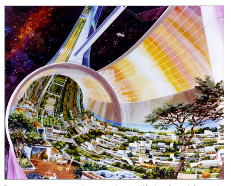
Three space colony summer studies were conducted at NASA Ames Research Center in the 1970s. A number of artistic renderings of the concepts were made, including this one, which shows a cutaway view of a fictional Toroidal (donut-shaped) Colony. (Artwork: Rick Guidice)

etary bodies inside our solar system like the moons of Saturn to distant discoveries like the Kepler and TRAPPIST-1 exoplanets. The visually engaging final product provides a creative imagining of a farsighted age of future exploration while bringing awareness to the promise of current discoveries.