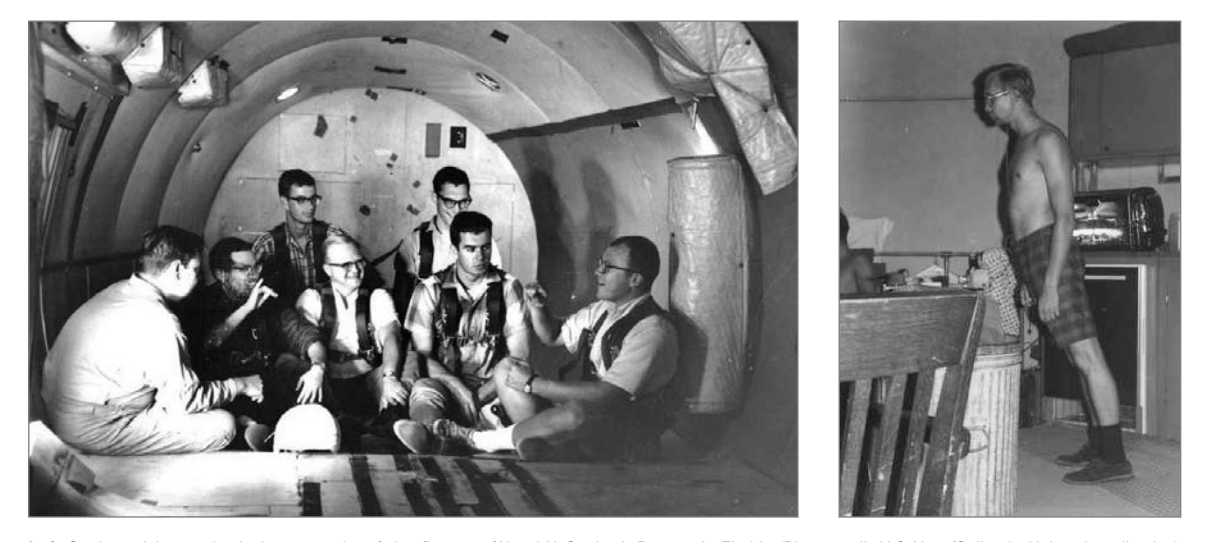
How 11 Deaf Men Helped Shape NASA's Human Spaceflight Program (continued)