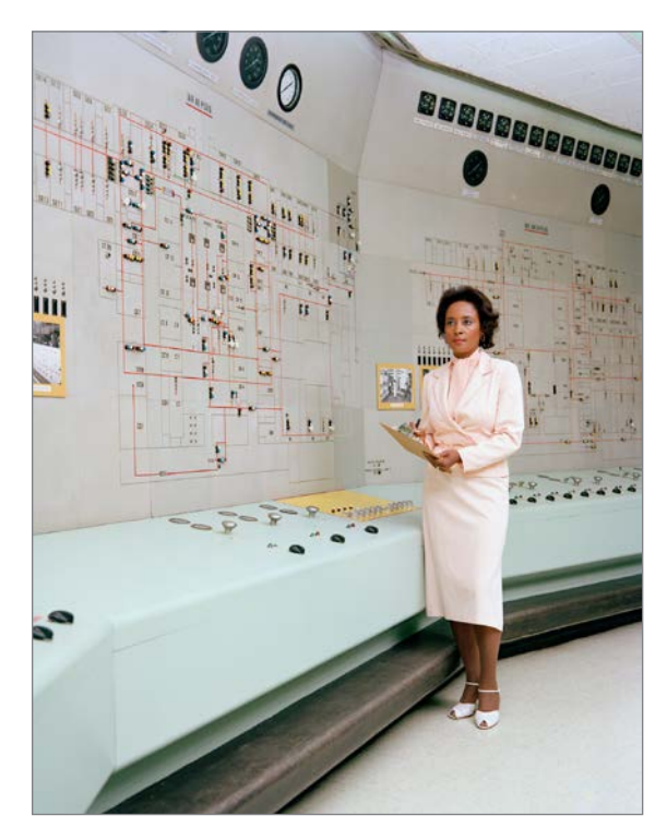
Annie Easley is pictured at the Plum Brook Reactor Facility.

The history office has been providing materials from our archival collection in support of a number of events tied to Hidden Figures and human computers. Some of our Annie Easley photos and audio footage were included at a special presentation during a Cleveland Cavaliers basketball game and also in an educational commercial spot on kids' television network Nickelodeon.