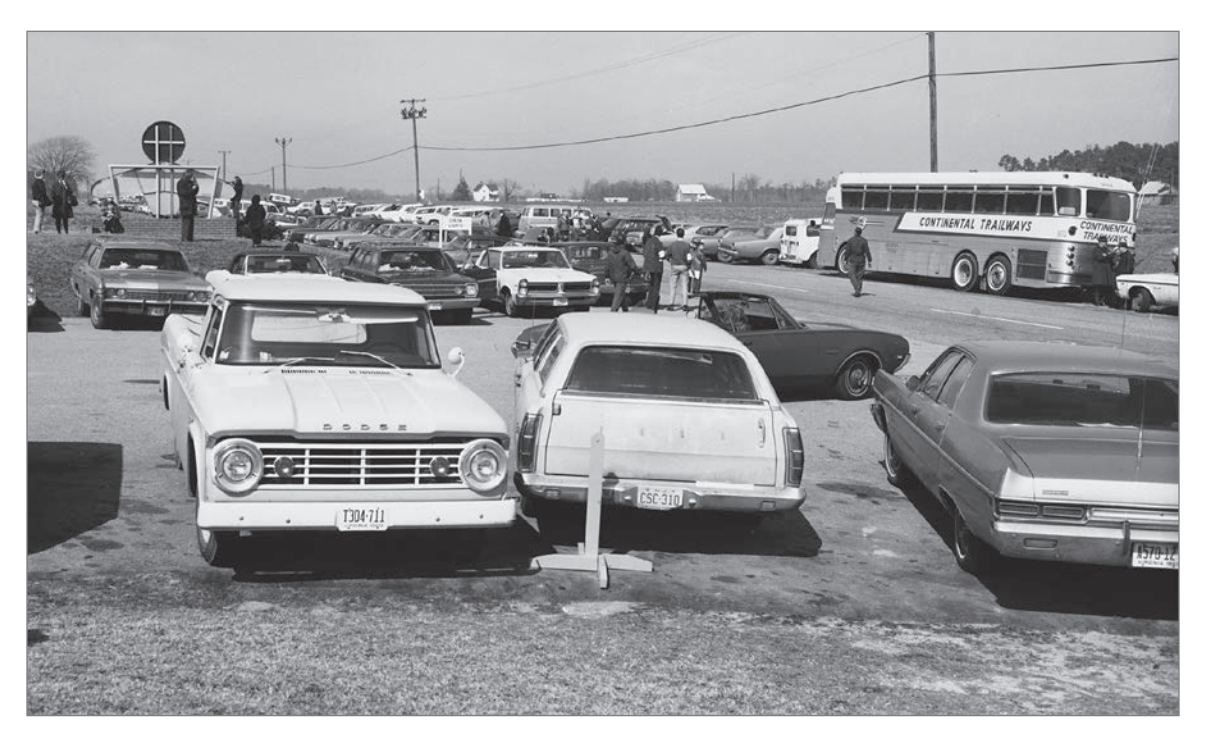
Thousands of people descended on the eastern shore of Virginia to witness the solar eclipse and the sounding rocket launches.

An estimated 12,000 to 14,000 people planted themselves across the bay from Wallops Island and the