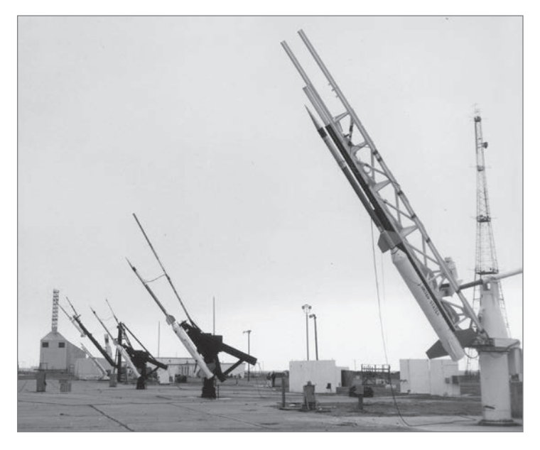
Thirty-two sounding rockets were launched at Wallops to conduct meteorological, ionospheric, and solar physics experiments surrounding the solar eclipse event.

Eight different launch vehicles were used: Arcas, Nike-Apache, Nike-Cajun, Nike-Tomahawk, Nike-Iroquois, Aerobee 150, Aerobee 170, and Javelin. These vehicles ranged in length from 8 to nearly 50 feet and could