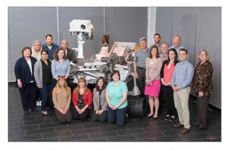
Attendees pose in front of a model of the Mars Science Laboratory Curiosity rover during the annual History Program Review at the Jet Propulsion Laboratory.

of us in the history and archival business, those pressures play out in some interesting ways. For example, nearly everyone at the meeting was facing the efforts of NASA's facility managers to demolish outdated buildings that are expensive to maintain. While this is a smart strategic move for the Agency in terms of reducing spending on buildings, most of the archival programs across NASA rely on old, underused buildings to store our archival collections and other items. Moving out of those facilities involves a cost, as well as the inevitable demand for a dramatic reduction in the size of the archival collection when it moves into another facility. The expectation is that archivists will simply digitize all of that paper and then throw it away. However, that expectation ignores a couple of important realities. First, digitization is neither quick nor cheap. Doing it right is hugely expensive (especially when dealing with the types of old paper documents found in archival collections across the Agency). Digitization also comes with an eternal maintenance cost. Digital records can degrade over time and need long-term care. More importantly, as digital formats, software, and security rules change over time, the digital collection needs continuing updates to make sure it remains accessible. A perfect example of this problem is the pile of floppy disks that hold my 1996