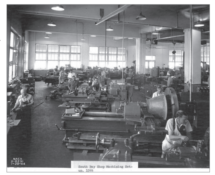
Machinists work in the Technical Services Building during World War II. Though not a wind tunnel, this property was included in the Wind Tunnel Historic District for its function as a production facility for equipment used to support testing and research, notably for aircraft and spacecraft models used in tunnel testing.

Arc Jet Complex (N-238, N-238, and Steam Vacuum System [SVS]): The complex is nationally significant for its scientific and engineering contributions to arc jet research and development at Ames. Built between 1962 and 1964, the three-unit complex is also associated with the research and development in the area of Thermal Protection Systems (TPS) for NASA's spaceflight programs, including the exceptional role