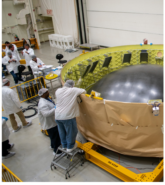
The completed Orion stage adapter for the SLS rocket for the Artemis I flight, with the mounting brackets for CubeSats in their dispensers.