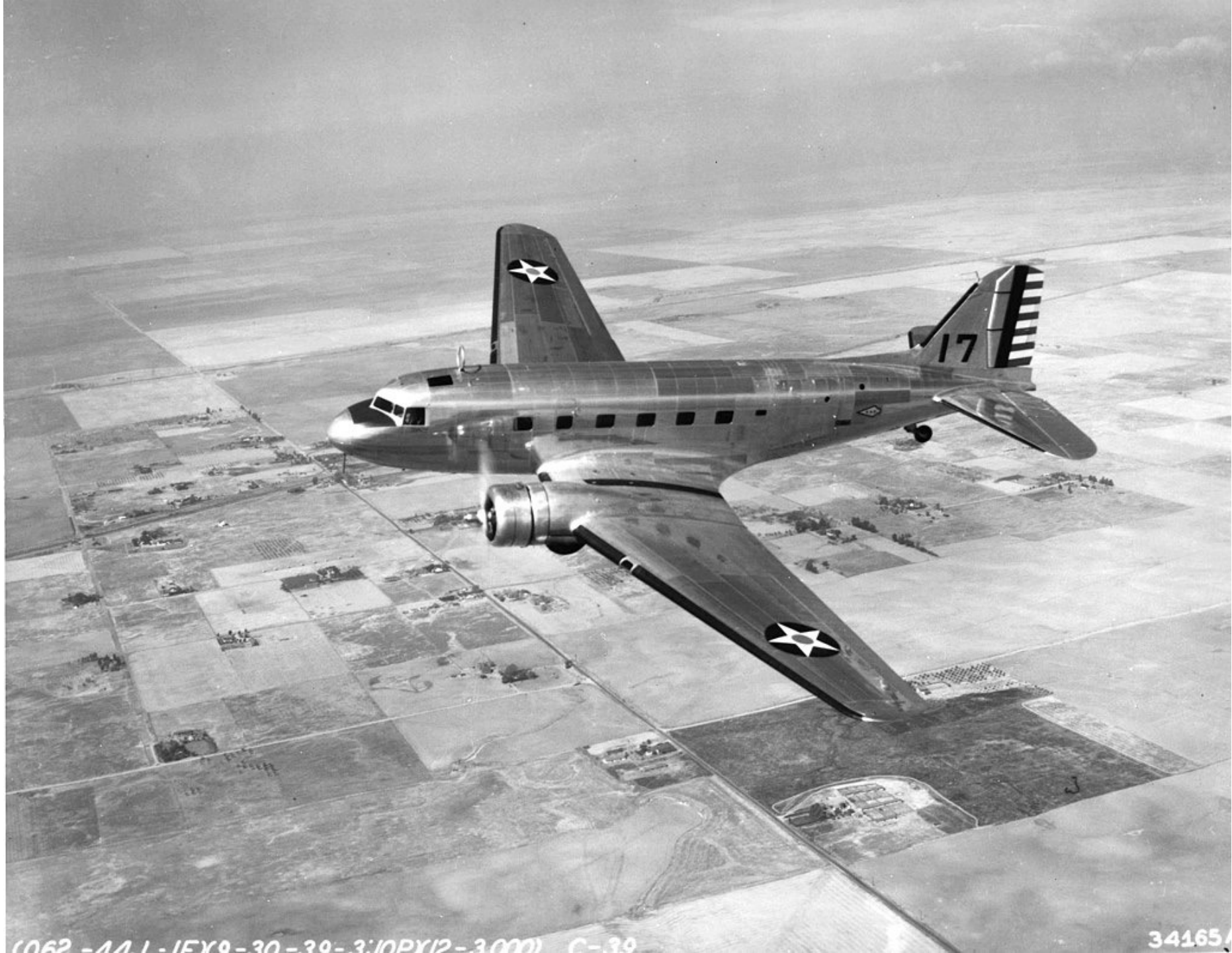
(062 - 441 - IFY9 - 30 - 39 - 3:10PX(2 - 3000) C-39