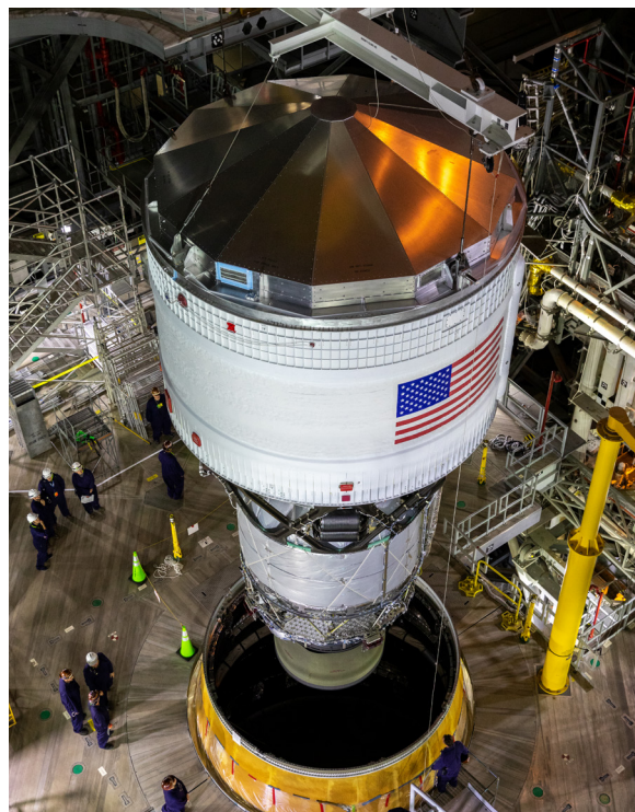
The ICPS stacked in the Vertical Assembly Building, Kennedy Space Center, in preparation for the Artemis I mission.