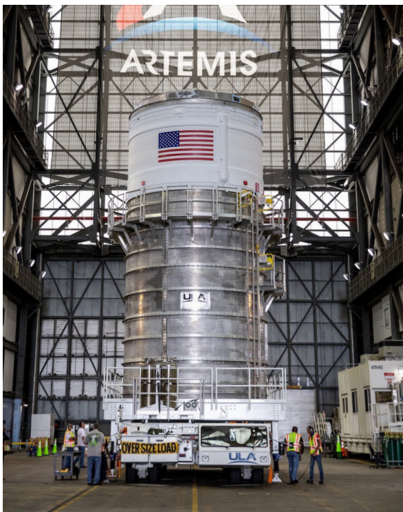
The ICPS, a modified United Launch Alliance Delta Cryogenic Second Stage, provides 24,750 lbs. of thrust for in-space propulsion for the Block 1 crew and cargo vehicles.

The ICPS is powered by one Aerojet Rocketdyne RL10 engine and generates 24,750 lbs. of maximum thrust. The propulsion system is managed under the SLS Program by the Spacecraft and Payload Integration and Evolution Office at the Marshall Space Flight Center.