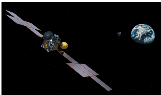
This artist's concept of a proposed Mars sample return mission portrays the Earth Entry System, bearing a container of Martian rock samples, heading toward Earth after separating from the Earth Return Orbiter spacecraft that carried the entry system and samples from Mars orbit to the vicinity of Earth.

Collectively, these containment engineering and verification activities are known as "breaking the chain" of contact with Mars. These processes would include steps taken at every stage of the campaign: on the surface of Mars, in orbit