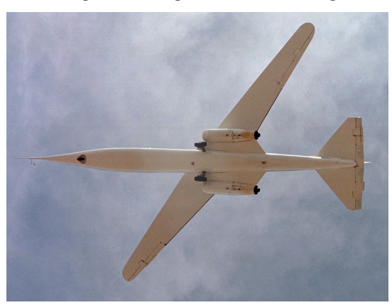
AD-1 inflight from below (NASA photo EC81-14632)

At lower speeds, during takeoffs and landings, the