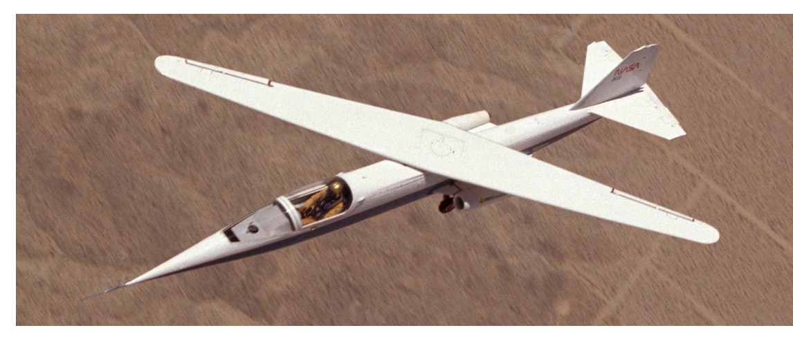
AD-1 in flight at 60 degree wing sweep

In a program conducted between 1979 and 1982, the NASA Dryden (now Armstrong) Flight Research Center in Edwards, California, successfully demonstrated an aircraft wing that can be pivoted obliquely from zero to 60 degrees during flight.