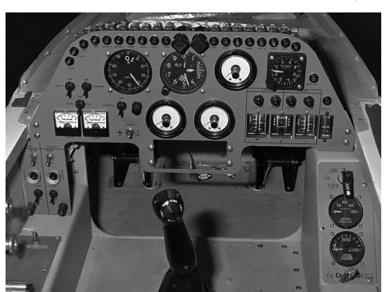
AD-1 cockpit and intrument panel