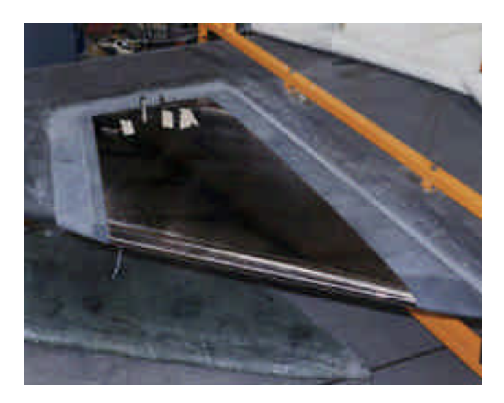
The nickel-plated steel glove, shown here undergoing heat tests in 1996, is bonded to the right wing and wraps from the underside of wing, over the leading edge and onto the upperside, although it does not cover the wing completely.

The glove carries a variety of traditional and highfrequency sensors capable of functioning during the flight conditions the Pegasus® rocket will experience. The sensors will give engineers a variety of information like acceleration, air flow, pressure, temperature and strain. Many of these sensors were evaluated in July 1994 aboard an earlier Pegasus® mission. The mission verified that the sensors do not interfere with the airflow over the Pegasus® wing and that the vibrations the sensors will experience during flight will not interfere with obtaining accurate data.