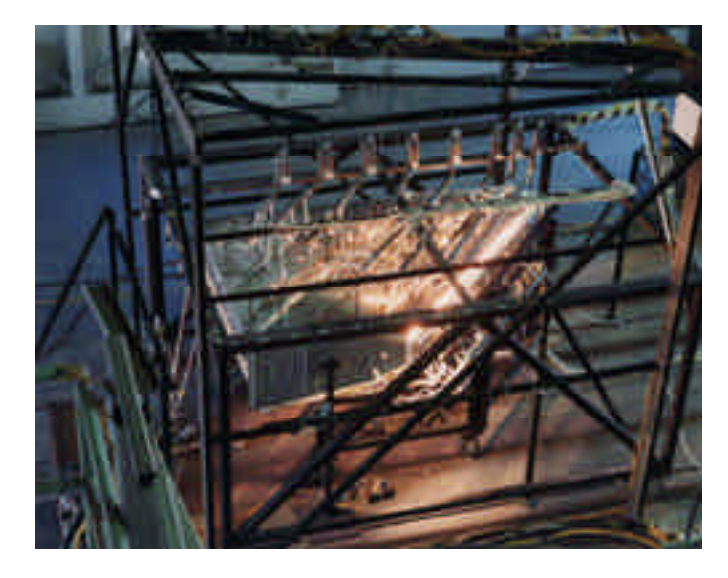
The experimental glove is made of nickel-plated steel and carries pressure and temperature instrumentation, among other instruments.

The flight-test glove is mounted on balsa wood and surrounded by a drag-reducing thermal protection system structure made of Space Shuttle tile material that blends the glove into the wing. NASA Ames Research Center, Moffett Field, CA, supplied the thermal protection system, which dissipates heat. The glove was mounted to the Pegasus® wing at Dryden. The Pegasus booster rocket will be secured to its L-1011 launch vehicle at the Orbital Sciences Corp.'s Vehicle Assembly Building at Vandenberg Air Force Base, CA