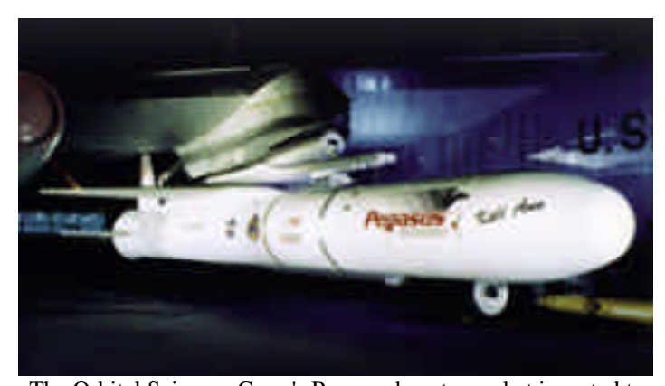
The Orbital Sciences Corp.'s Pegasus booster rocket is mated to Dryden's B-52. Orbital's L-1011 now serves as the Pegasus mothership.

The hypersonic X-15 experienced such problems due to turbulence-induced friction. In addition, turbulent air creates more "drag," slowing down aircraft or making them less efficient.