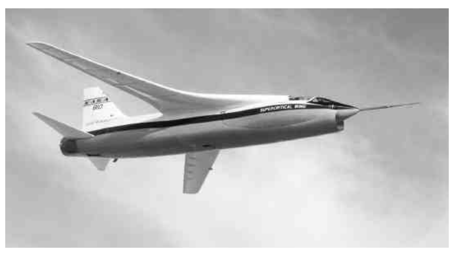
F-8 Supercritical wing in flight.