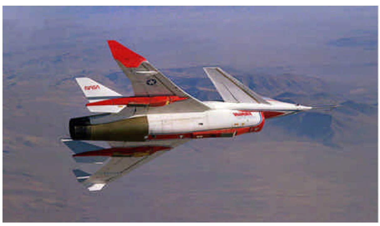
HiMAT remotely piloted research vehicle