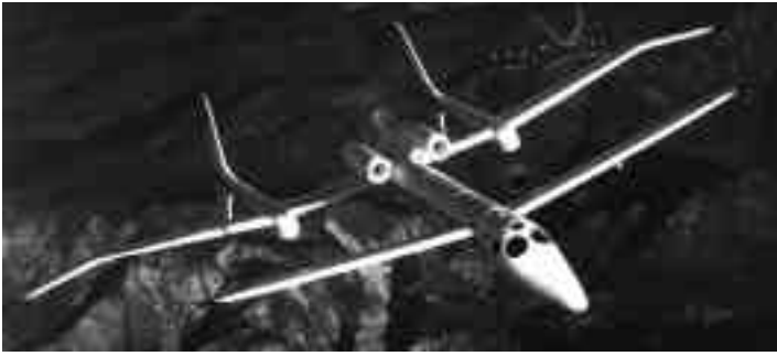
Proteus, built by Scaled Composites Inc.

aircraft is larger and heavier than other consumable-fuel aircraft involved in ERAST. The Proteus is a tandem-wing design intended to carry payloads of up to 2,000 pounds to altitudes above 60,000 feet and to remain on station up to 14 hours. Development of the Proteus under ERAST focused on supporting development of the aircraft's flight control system to allow it to be an "optionally piloted" aircraft, capable of being flown either by an onboard pilot or autonomously. Proteus was also utilized to validate many of the technologies required for UAVs, including over-the-horizon command and control communications.