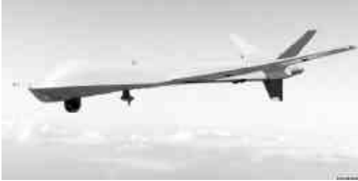
Altair, being built by GA-ASI.

The Altair, a civilian variant of the enlarged, upgraded version of the RQ-1A Predator military reconnaissance UAV called the Predator B, has been developed by General Atomics-Aeronautical Systems Inc. (GA-ASI) to meet specific requirements of NASA's Earth Science Enterprise for a flight-validated consumable-fuel UAV to perform on-location science missions. Under a cost-sharing agreement with NASA, GA-ASI