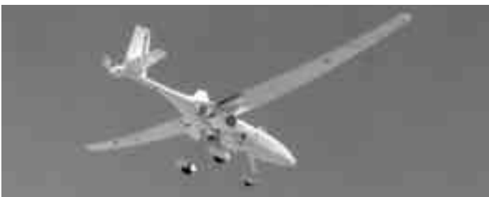
Perseus B, built by Aurora Flight Sciences.

The Perseus B is the third generation of the Perseus design developed by Aurora Flight Sciences Inc., having been preceded by the Perseus proof-of-concept demonstrator and the Perseus A aircraft. Aurora flew the Perseus B aircraft to an altitude over 60,000 feet in 1998, meeting an ERAST milestone. The Perseus B