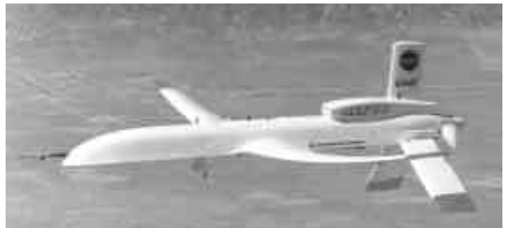
Altus II, built by General Atomics/Aeronautical Systems Inc.

General Atomics/Aeronautical Systems also produced the dual-turbocharged Altus II aircraft, a modified version of the RQ-1A Predator military reconnaissance UAV designed for civilian environmental science missions. The Altus II is also powered by a small four-cylinder Rotax piston engine driving a rear-mounted pusher propeller. The Altus II expanded its flight envelope to the point where it met an ERAST mission requirement for four hours flight duration at 55,000 feet altitude, and also maintained flight above