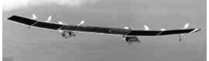
Pathfinder-Plus, built by AeroVironment Inc.

First came the 98-foot wingspan Pathfinder which set unofficial world records for solar-powered and propeller-driven aircraft, leading to in a flight to