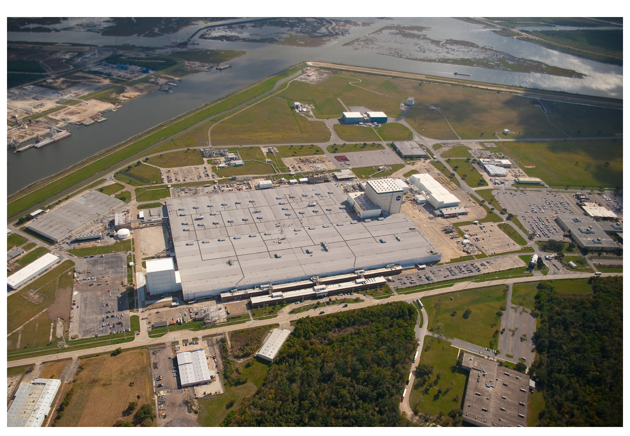
An aerial view of the main building at Michoud Assembly Facility, which features more than 43 acres of advanced manufacturing under one roof and convenient interstate, railway and port access.

factory," the nation's premiere site for manufacturing and assembly of large-scale space structures and systems. The government-owned manufacturing facility is one of the largest in the world, with 43 acres of manufacturing space under one roof—a space large enough to contain more than 31 professional football fields. Michoud is managed by NASA's Marshall Space Flight Center in Huntsville, Alabama, with several areas of the facility used by commercial firms or NASA contractors.