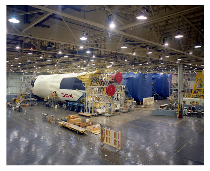
Experience and expertise gained while building the Saturn stages (above) and the space shuttle external tanks (below) benefit SLS core stage development and manufacturing.