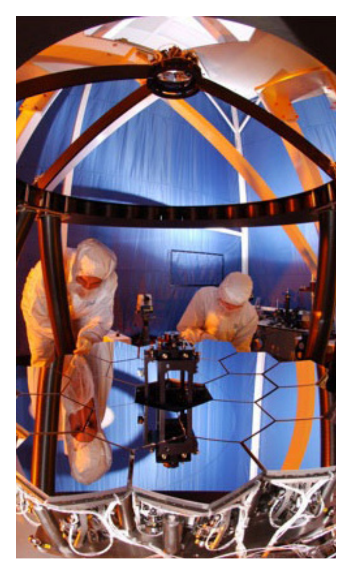
Engineers test the Wavefront Sensing and Control testbed for the James Webb Space Telescope. The test is performed on a 1/6 scale model of the JWST mirrors.

NASA's Office of Small Business Programs primary mission since its inception has been to increase the representation of small businesses in NASA's contracting efforts. Our efforts encompass all federally recognized socio-economic small business categories and we work hard to make sure each type of business gets a fair chance to work with NASA.