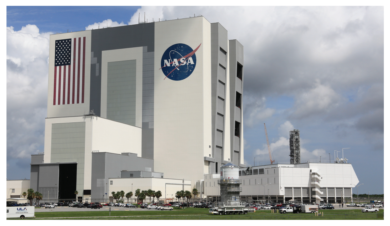
NASA's Vehicle Assembly Building (VAB) at Kennedy Space Center in Florida is one of the largest buildings in the world by volume. The VAB, which served as the final assembly point for space shuttles for 30 years, has been upgraded to support NASA's 21st century launch complex.

The Vehicle Assembly Building, or VAB, is a national landmark that remains a central element in NASA's plans to launch people and equipment deep into space on missions of exploration, including the agency's Artemis program. Built at NASA's Kennedy Space Center in Florida, the VAB will serve as the central hub of the premier multi-user spaceport, capable of processing several different kinds of rockets and spacecraft at the same time.