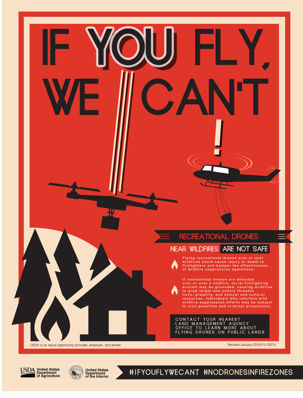
Figure 2. https://www.nifc.gov/drones/outreach.html