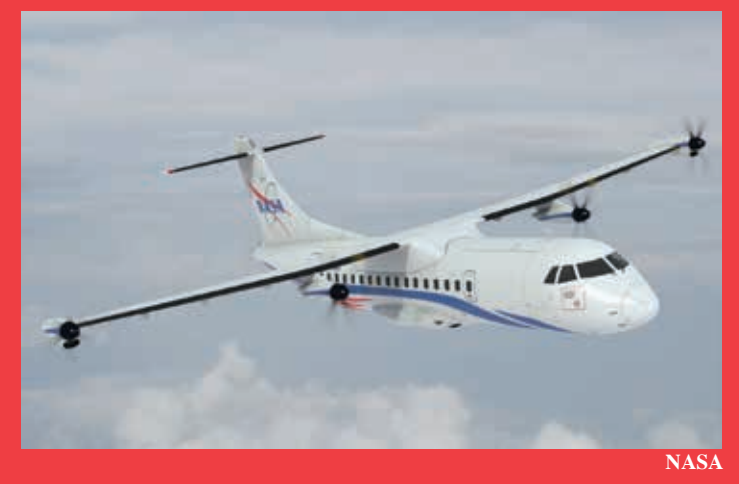
This is a NASA illustration of an advanced subsonic aircraft with an Electrified Aircraft Propulsion system.

NASA has selected two U.S. companies to support its Electric Powertrain Flight Demonstration (EPFD) that will rapidly mature Electrified Aircraft Propulsion (EAP) technologies through ground and flight demonstrations.