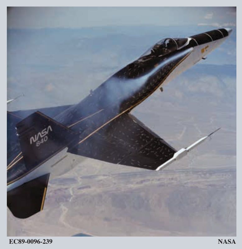
NASA Armstrong (then Dryden) researchers used smoke generators and varn tufts for flow visualization studies on an F/A-18 as part of the High Alpha Research Vehicle (HARV) project.

Following an inadvertent canopy jettison with Bill Dana flying the airplane on flight 101 (it's a story, ask me sometime), we ended Phase 1 and moved on to Phase 2, where we expanded the airplane envelope to extreme anglesof-attack. We contracted with McDonnell Douglas to develop a multi-axis Thrust Vectoring Control System and Research Flight Control System to allow controlled flight over 55 degrees angle of attack (AoA). I had a few very cool jobs for Phase 2. Still working with Jerry Henry and the electric shop, we rebuilt and integrated the emergency backup electric and hydraulic systems to supply backup power in the event of a dual engine flameout at high AoA.