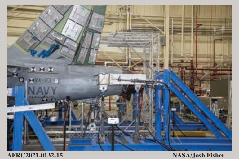
The horizontal tail is under test load on the F/A-18E.

The F/A-18E actuator is positioned for pinning to the horizontal tail load test fixture.