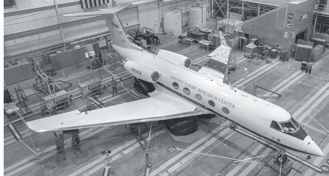
NASA's G-III flying test bed aircraft rests on three pneumatic lifting devices or "airbags" in preparation for loads testing in NASA Armstrong's Flight Loads Lab.

ACTE project researchers have replaced the airplane's conventional aluminum flaps with advanced, shape-changing assemblies that form continuous conformal surfaces with no visible gaps. Evaluation of the revolutionary new flap system is a joint effort between NASA and the U.S. Air Force Research Laboratory. The advanced flexible trailingedge wing flaps have the potential Michigan,