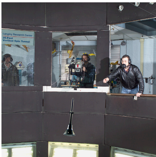
Orion Launch Abort System model being tested in the VST.

The VST has supported the development of nearly all U.S. military fighter and attack airplanes, trainers and bombers, as well as some foreign designs. It is the only resource available to commercial aircraft manufacturers for proprietary spin-and-tumble assessments of their products in a wind tunnel environment.