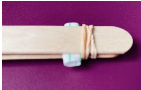
Figure 5. Wrap one of the thin rubber band around the tongue depressors to hold them together

5. To hold the tongue depressors together, wrap one of the thin rubber band around two tongue depressors between one of the straw pieces and the end of the tongue depressor as shown in Figure 5.