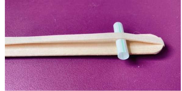
Figure 3. Place one piece of the straw between the rubber band and the tongue depressor

3. About one inch from the end of the tongue depressor, place one piece of the straw between the rubber band and the tongue depressor as shown in Figure 3.