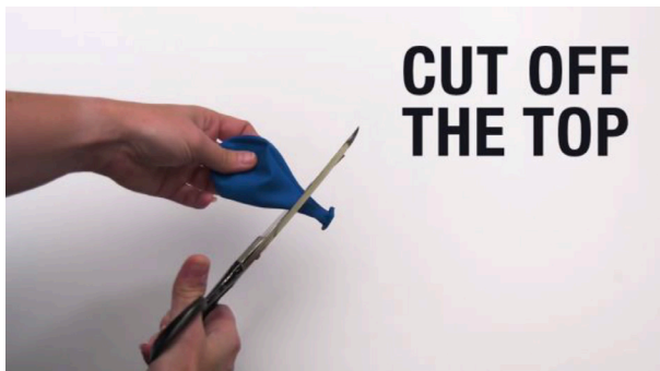
Figure 1. Cut the top off.