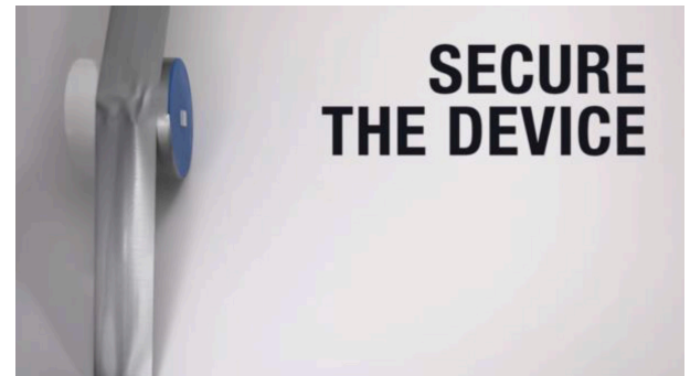
Figure 6. Firmly attach the PVC set-up to a table or other flat surface.