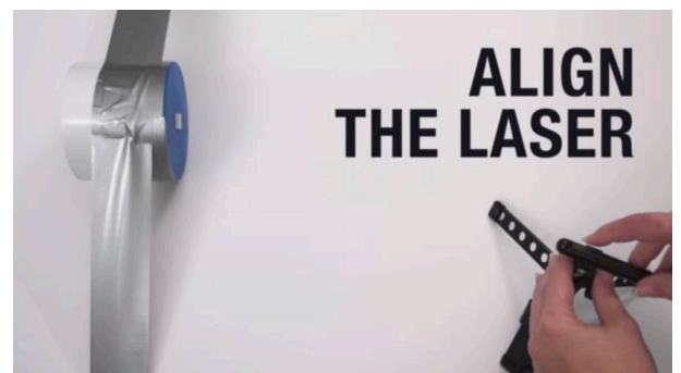
Figure 7. Align the laser so the light beam reflects off the mirror onto the wall

Position the laser pointer so that it reflects off the mirror onto the light colored wall or large piece of white paper as shown in Figure 7. The laser needs to stay on and motionless. If it has a push button instead of an on/off switch, use a piece of tape to keep the button pushed so the laser stays on.