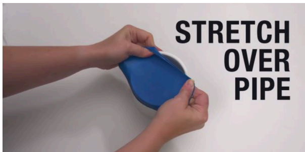
Figure 2. Stretch the balloon over one end of the PVC pipe coupler.