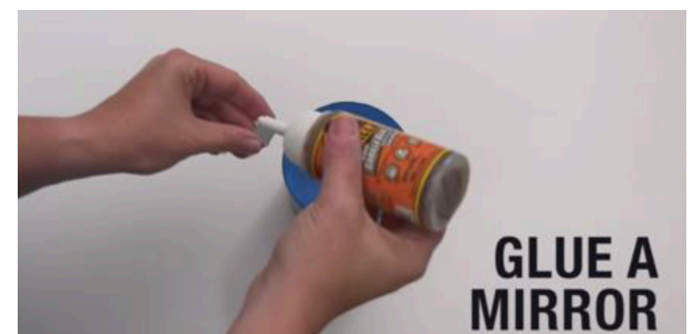
Figure 4. Glue the mirror to the center of the balloon