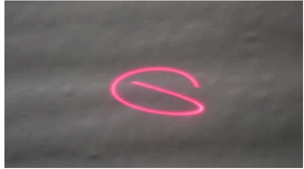
Figure 8. The light should move on the wall in response to the sound