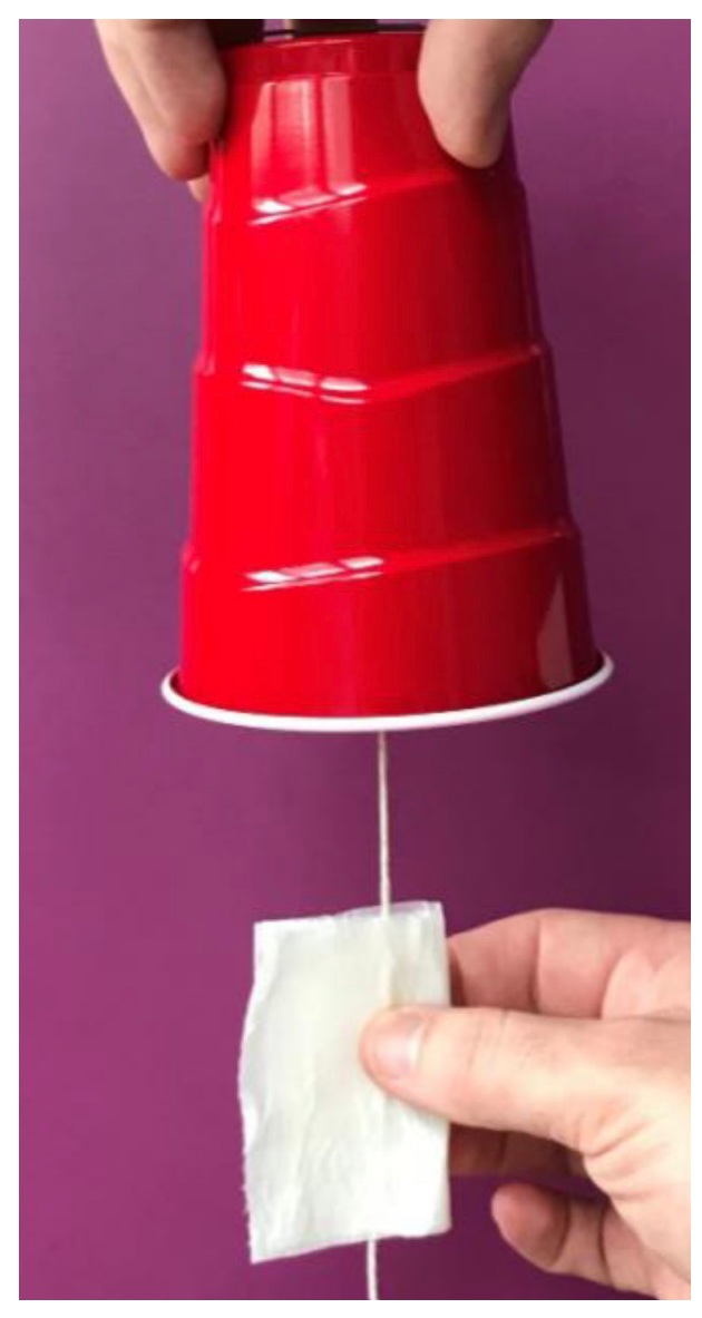
Figure 6. Pull the paper towel down while squeezing it.

7. Hold the cup upside down with one hand.With the other hand, wrap the wet paper towel around the string as shown in figure6. Pull down on the string and paper towel while squeezing the towel against the string.