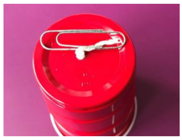
Figure 4. The paper clip should sit on the outside of the bottom of the cup.

4. Pull the string the rest of the way through the hole until the paper clip is resting on the bottom of the cup as shown in Figure 4.