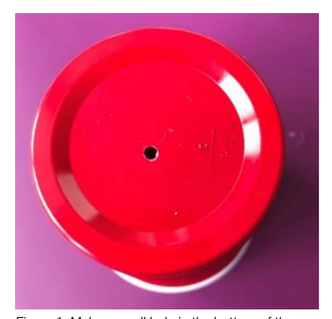
Figure 1. Make a small hole in the bottom of the cup

Begin by making a small hole in the bottom of the plastic cup as shown in Figure 1 . If needed, ask an adult to help you make the hole.