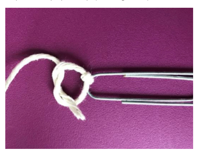
Figure 3. Tie the string to the paper clip.

3. Tie the end of the string that is outside the cup to the paper clip (see Figure 3 ).