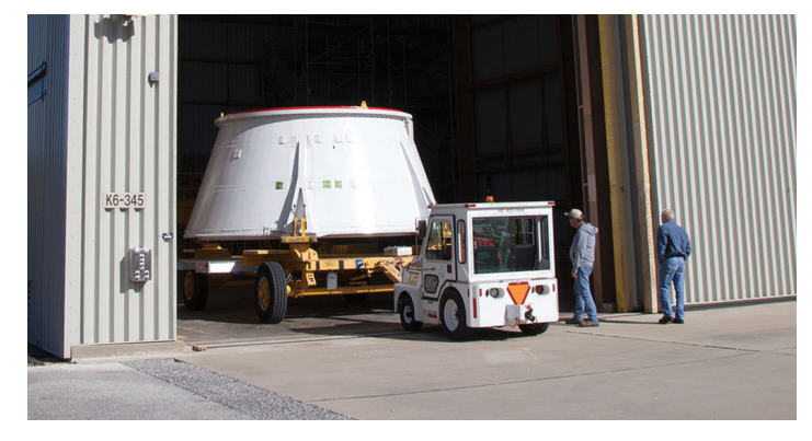
An aft skirt similar to one that will be used on a solid rocket booster for NASA's Space Launch System rocket, arrived at the Rotation, Processing and Surge Facility at NASA's Kennedy Space Center in Florida on Jan. 20, 2016. The aft skirt was inspected and prepared for SRB pathfinder operations.

Constructed in 1984, the RPSF was once used for receiving solid rocket motor segments for the Space Shuttle Program and was recently upgraded to prepare for SLS. The facility is eligible for nomination to the National Register of Historic Places, as determined in a historical survey conducted in 2006 and 2007.