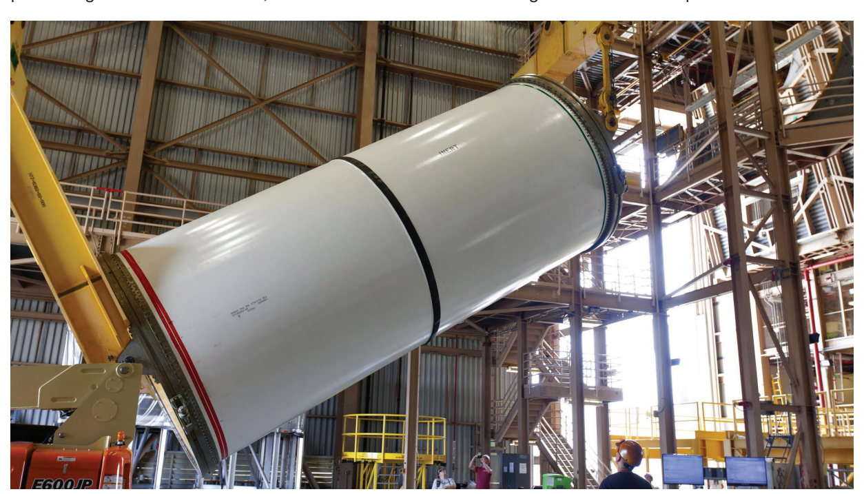
Technicians watch as a crane and special mechanism begin breakover, or flipping, of the mated Thrust Resistance Structure and Guidance Control Assembly for the Orion Program's Ascent Abort-2 flight test during practice, or pathfinder activities, June 22, 2018, inside the Rotation, Processing and Surge Facility at NASA's Kennedy Space Center in Florida.

The aft assembly, three center segments and the forward segment will be transported and stored in