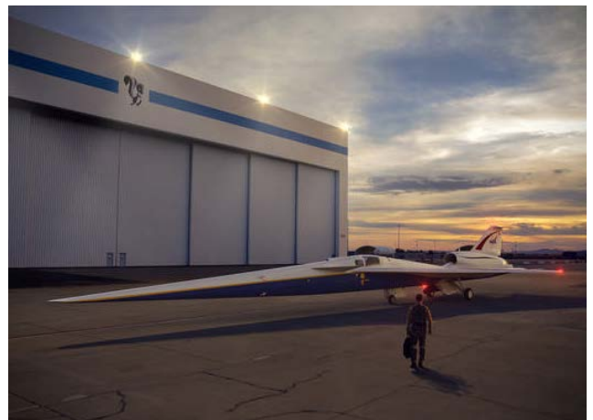
Figure 2. The X-59's unique design reduces the sonic boom to a quieter sonic thump.

In 2023, the X-59 Quiet Supersonic Technology (QueSST) will begin community flight tests that will demonstrate that annoying sonic booms can be transformed into quieter “sonic thumps.” These flights and the data they generate will pave the way for a next generation of commercial supersonic flight.