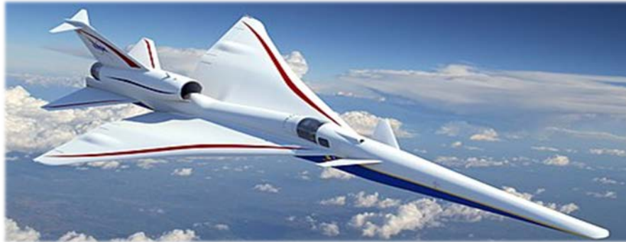
Figure 1. The X-59 in flight