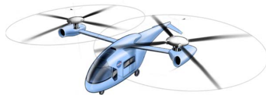
Figure 3. Flying taxis and other aircraft will be controlled through a system known as AAM.

Advanced Air Mobility: Soon flying taxis, package-carrying drones and other similar aircraft will be common sights in the skies over towns. NASA is leading the way to develop a system for controlling these aircraft as they fly passengers and cargo over urban and rural areas. This system is known as Advanced Air Mobility (AAM).