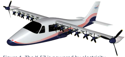
Figure 1. The X-57 is powered by electricity.

Electrified Aircraft Propulsion: The X-57 (Figure 1) is one of the first airplanes fully powered by electricity, meaning that it produces no harmful emissions when it flies. NASA is working with industry partners to use the technology from the X-57 to produce larger passenger-carrying airplanes that are partially or fully powered by electricity.