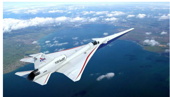
Figure 2. The X-59 is designed to fly supersonically without creating a sonic boom.

Low-boom Flight Demonstrator: For many years, planes have been able to fly faster than the speed of sound, or supersonically. Unfortunately, when planes fly this fast, they produce a very loud noise called a sonic boom. As a result, nonmilitary supersonic flight over land is not currently allowed. NASA's X-59 (Figure 2) airplane is designed to fly supersonically without creating a sonic boom. NASA will be flying the plane over different communities across the U.S. in an attempt to demonstrate that supersonic flight is possible without creating harmful noise pollution. If successful, the hope is that supersonic flight over land will become a reality.