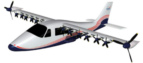
Figure 1. The X-57 is powered by electricity.

The X-57 (Figure 1) is one of the first airplanes fully powered by electricity, meaning that it produces no harmful emissions when it flies. NASA is working with industry partners to use the technology from the X-57 to produce larger passenger-carrying airplanes that are partially or fully powered by electricity.