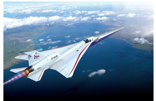
Figure 2. The X-59 is designed to fly supersonically without creating a sonic boom.

For many years, planes have been able to fly faster than the speed of sound, or supersonically. Unfortunately, when planes fly this fast, they produce a very loud noise called a sonic boom. As a result, nonmilitary supersonic flight over land is not currently allowed. NASA's X-59 (Figure 2) airplane is designed to fly supersonically without creating a sonic boom. NASA will be flying the plane over different communities across the U.S. in an attempt to demonstrate that supersonic flight is possible without creating harmful noise pollution. If successful, the hope is that supersonic flight over land will become a reality.