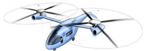
Figure 3. Flying taxis and other aircraft will be controlled through a system known as AAM.

Soon flying taxis, package-carrying drones and other similar aircraft will be common sights in the skies over towns. NASA is leading the way to develop a system for controlling these aircraft as they fly passengers and cargo over urban and rural areas. This system is known as Advanced Air Mobility (AAM).