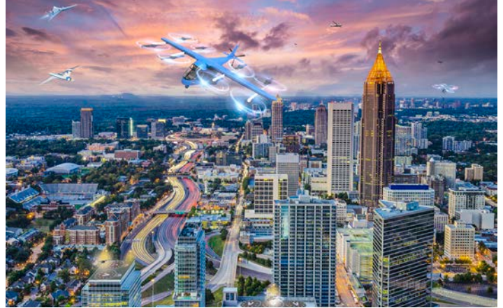
Figure 1. Air metro carries small groups of passengers between vertiports following prescheduled routes.

Air metro vehicles can only takeoff and land from certain facilities called vertiports. Vertiports can be standalone buildings, or terminals placed atop existing buildings. To maximize the convenience of air metro, vertiports are in both downtown and suburban areas.