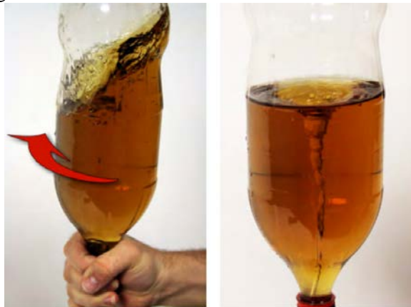
Figure 4. Swirl the bottle to create the vortex

The swirling water is creating a water vortex. The vortex is a funnel shape with a hollow center, just like a tornado. As such, the air from the bottle below can now pass unrestricted through the center of the vortex and into the bottle above.