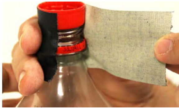
Figure 2. Attach the cap, upside down, to the top of one bottle