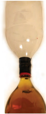
Figure 3. Connect the bottles